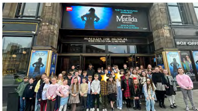
Tealing & Strathmartine joint school trip to Matilda in Edinburgh