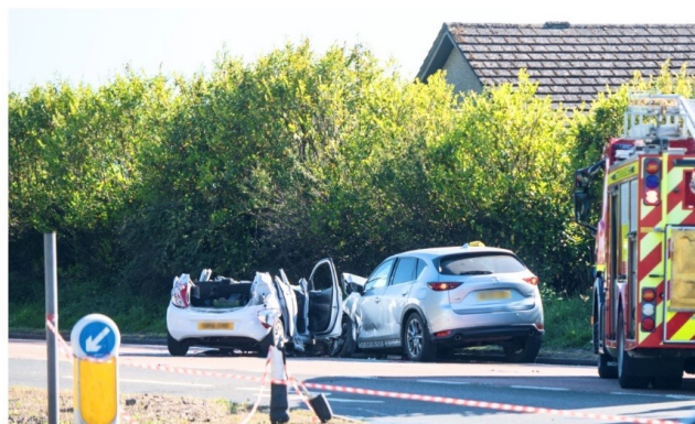
The A90 was closed for several hours after the crash.

In this issue the community council responds to serious concerns from residents about repeated road traffic accidents at the A90 junctions through Tealing and asks who is willing to come together to form a new campaign group for safety improvements. Email tealingcommunitycouncil@gmail.com to get involved.